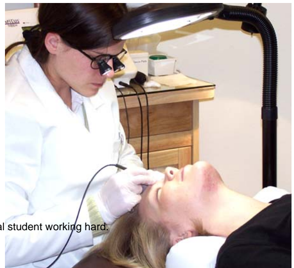
An actual student working hard.

The candidate will be given a written and practical assessment in person at the River Rock Electrology Institute that is commensurate with the final exams our students would take. If the candidate passes the assessment, they will be allowed to sit for Wisconsin State Board Exams.