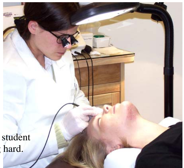
An actual student working hard.

The candidate will be given a written and practical assessment in person at the River Rock Electrology Institute that is commensurate with the final exams our students would take. If the candidate passes the assessment, they will be allowed to sit for Wisconsin State Board Exams.