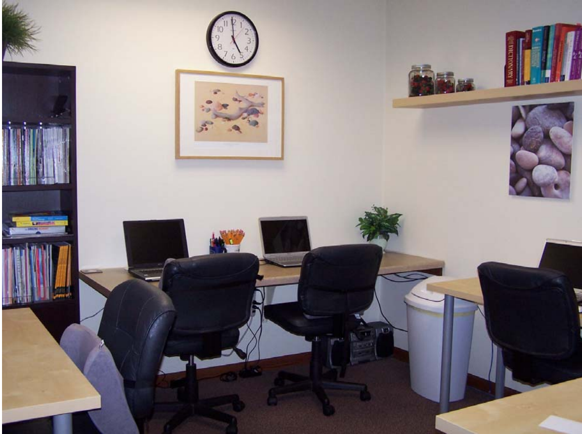
Our computer lab and library

Please see the current River Rock Institute of Electrology Catalog for the most up-to-date policy information.